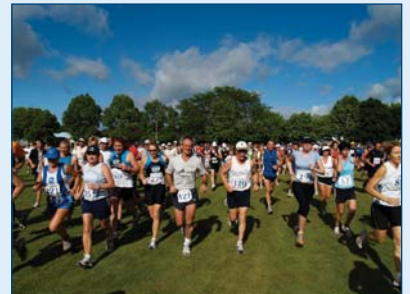
Bay of Plenty Electricity is a long-term sponsor of the annual Toi's Challenge.

As the primary sponsor of this iconic regional event for the 10th year in a row, Bay of Plenty Electricity would like to thank the Whakatane Athletic and Harrier Club for again conducting such a well organised and professionally run Challenge. We are proud to be the long-term supporter of such an event that promotes an active lifestyle while promoting our region in such a positive way.