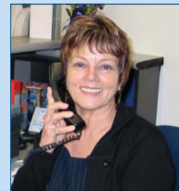
Bay of Plenty Electricity Customer Care Team members can assist you with payment options to help keep your account up to date.

If you do find yourself on holiday and realise that you have forgotten to pay your Bay of Plenty Electricity account, you have the option of paying at a Bay Beta Electrical store or at any New Zealand PostShop around the country.